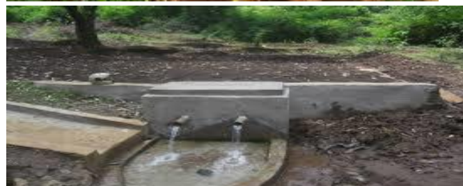
Spring protection & Livelihoods