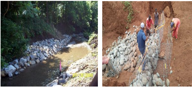
Gabion construction by WRUA members