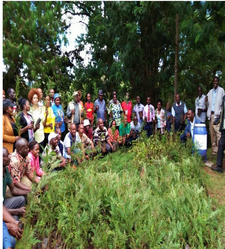
Tree planting by WRUAS