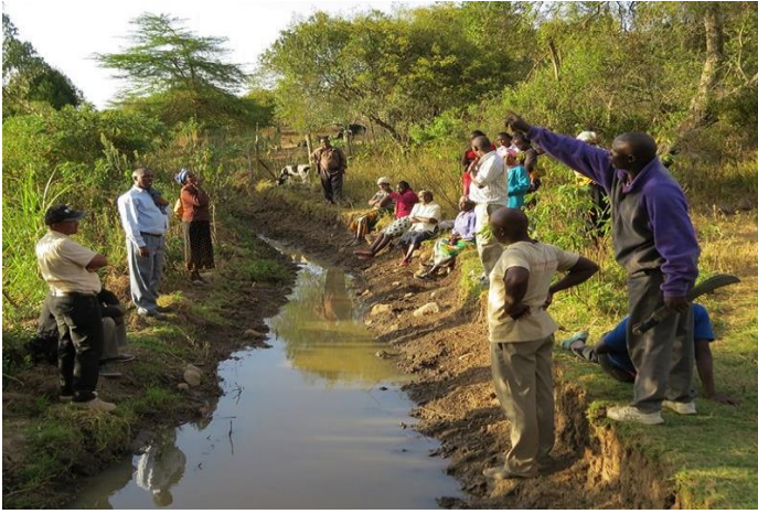
Conserving the riparaian zones by wrua