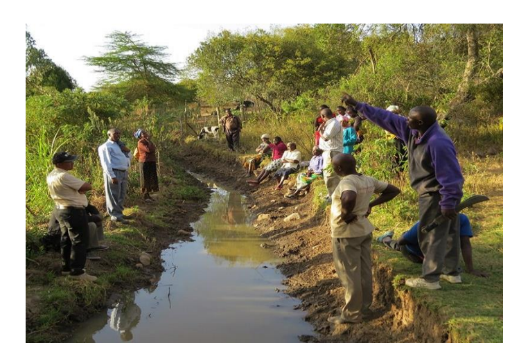
Conserving the riparaian zones by wrua