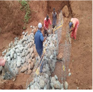
Gabion construction by WRUA members