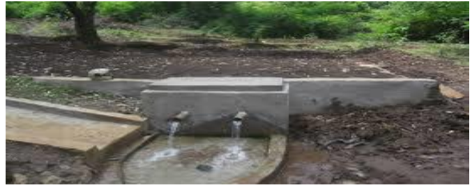
Spring protection & Livelihoods